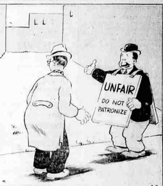
"I know it's a vacant lot—but the building that used to be here was torn down by non-union wreckers!"