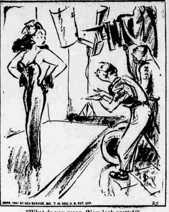
"What do you mean, 'Now look pretty!'"