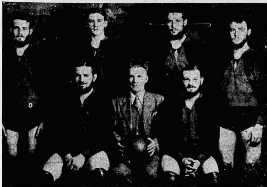
The House of David basketball team, one of the most colorful quintets in the nation, will meet the Roseburg All-Stars in a basketball game at Roseburg senior high school gymnasium at 7:30 p. m. Monday, Jan. 27. All net proceeds from the game will go to the senior high school athletic fund, as all local players are donating their services for the benefit program.