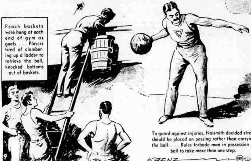
Peach baskets were hung at each end of gym as goals. Players tired of clambering up a ladder to retrieve the ball, knocked bottoms out of baskets.