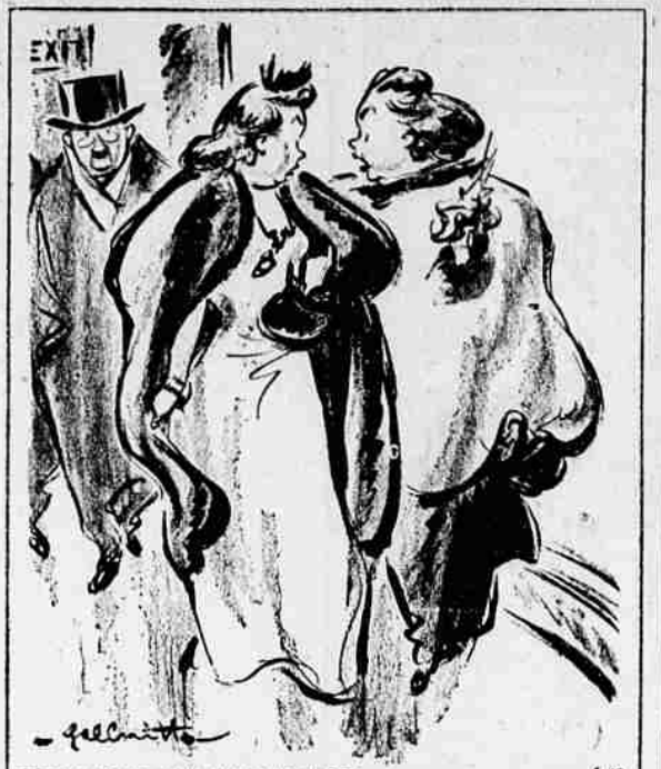
"I must be getting old—I feel so flattered when someone tells me how young I look!"