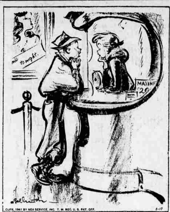
"I can remember the very first night we met—Clark Gable was playing and there was a newsreel on Singapore in Technicolor!"