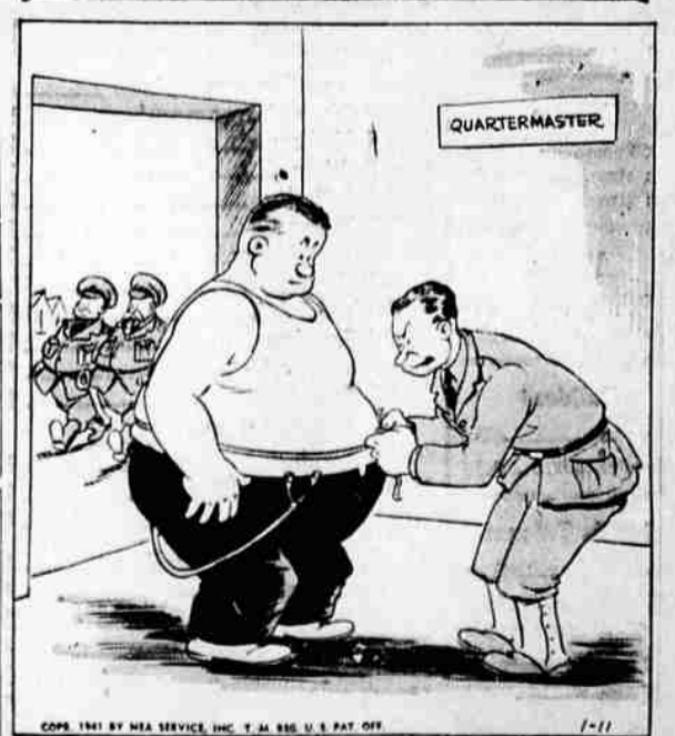
"If you can't get rid of that bay window, the only thing I can advise is to become a general as soon as possible!"