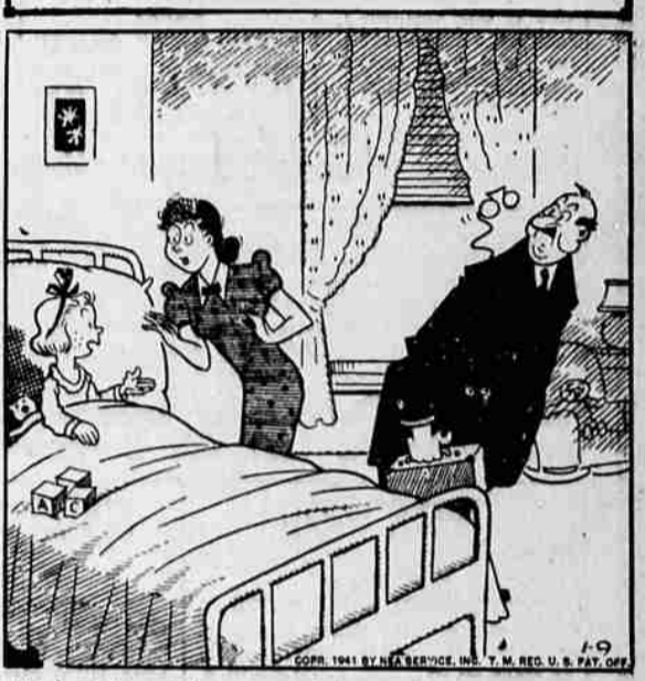
"But, Mother, he's not a real doctor—he didn't make me say 'Ah-h-h'!"