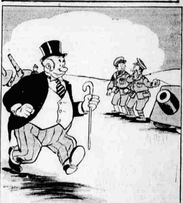
"Better keep an eye on me, Sarge, when that hat comes into range!"