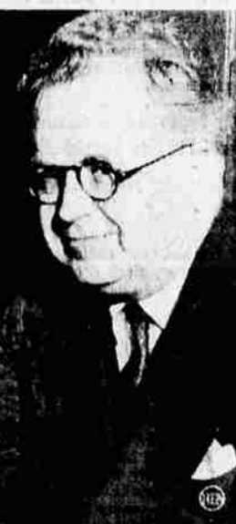
Dr. Henry F. Grady, who recently resigned as assistant secretary of state in Washington to become president of the American President Lines, takes over his new duties in his home city of San Francisco.