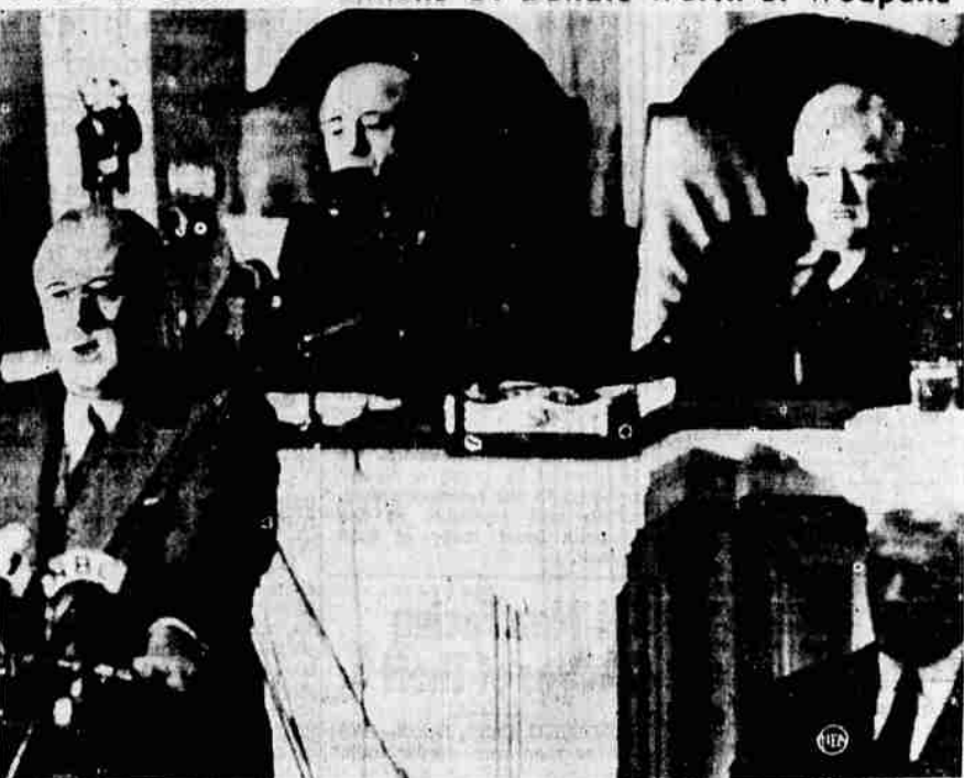
Speaking before a joint session of the Senate and the House, President Roosevelt is seen as he asked Congress for appropriations and authorizations to turn America into a tremendous arsenal for nations fighting against the march of aggressors in all parts of the world. Behind the President are Vice President John N. Garner, right, and Speaker of the House Rayburn.