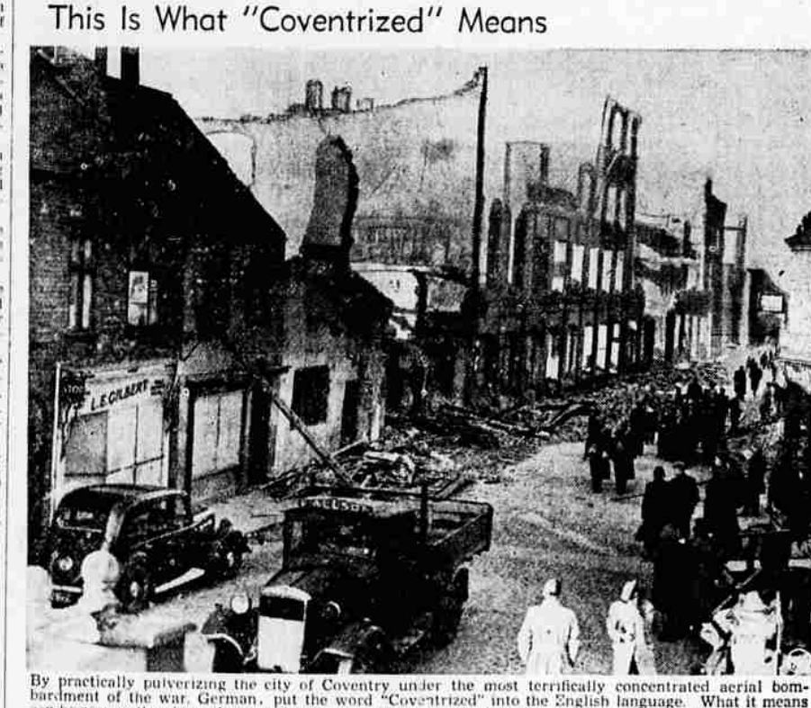
By practically putverizing the city of Coventry under the most terrifically concentrated aerial bom-bardment of the war, German, put the word "Coventrized" into the English language. What it means the seen in the photo above, which shows a whole street of completely gutted buildings in the great "rediands industrial city. Workers have cleared street of most of debris and traffic has been resumed.

With the gradual destruction of the great German industrial machine its aim, Britain's Royal Air Force is systematically bombing factories, munitions works, shipyards, docks, oil stores and railways of cities in the western half of the Reich. Map shows number of times industrial cities have been bombed since war began, R. A. F. has scored hits on more than 300 German towns and bases, including sub-marine and plane bases established in occupied countries.