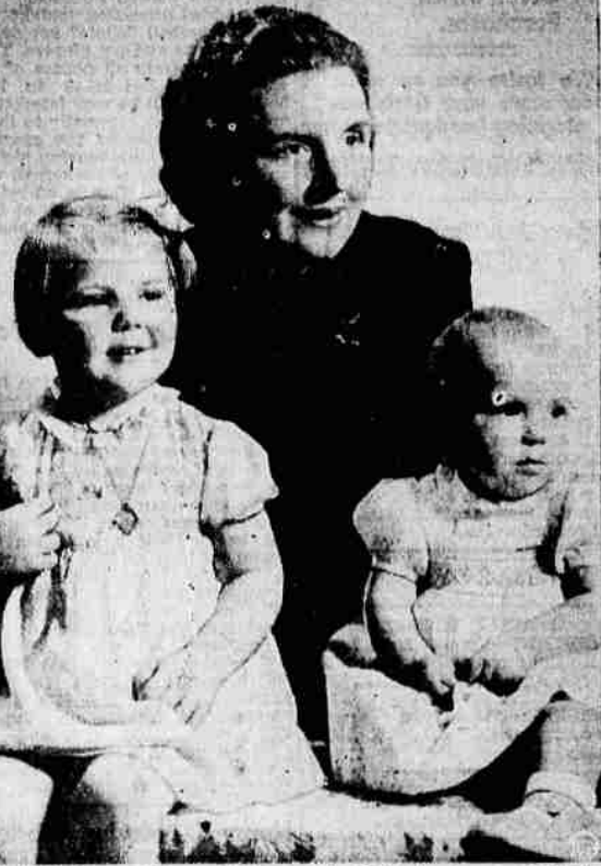
H. R. H. Crown Princess Juliana of the Netherlands, now living in Canada, will be a guest of President and Mrs. Roosevelt at the White House before Christmas. Photo above, taken in Ottawa recently, is the latest portrait of the royal refugee and her two daughters, Princess Beatrix, left, and Princess Irene.