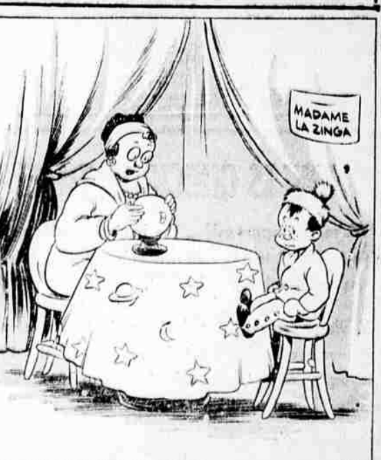
"I see a train of cars, a sled and a new suit—but definitely not a bicycle."