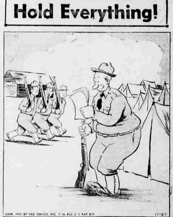
"Coggswell doesn't drill with the rest of the boys-he's learning the manual of arms by correspondence course!"