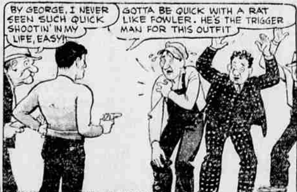
He Has It Coming