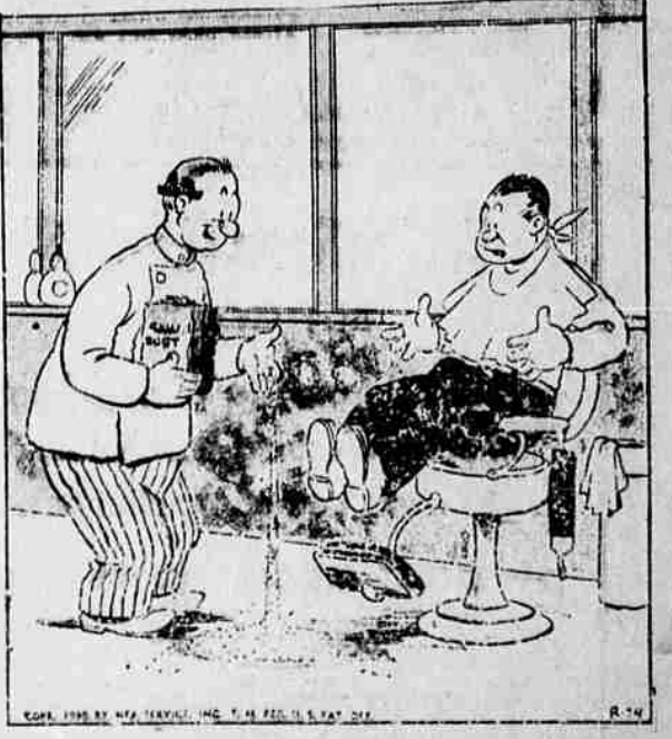
"I always sprinkle sawdust on the floor-I used to work in a butcher shop.