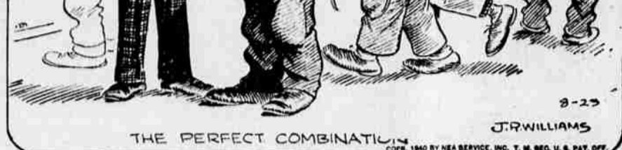
THE PERFECT COMBINATION

NO, HE'S GITTIN' FOXY WITH AGE-- HE'S SMART ENOUGH TO KNOW THAT YOUTH IS FULL O' IDEAS AND PEP--IN OTHER WORDS, YOUTH KEEPS TH' OLD UP AND TH' OLD KEEPS YOUTH DOWN--GIT IT?