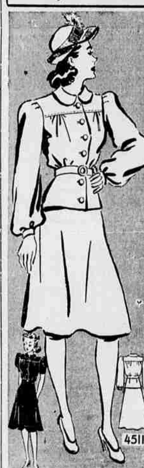
ONE OR TWO-PIECE SHIRT-FROCK PATTERN 4511