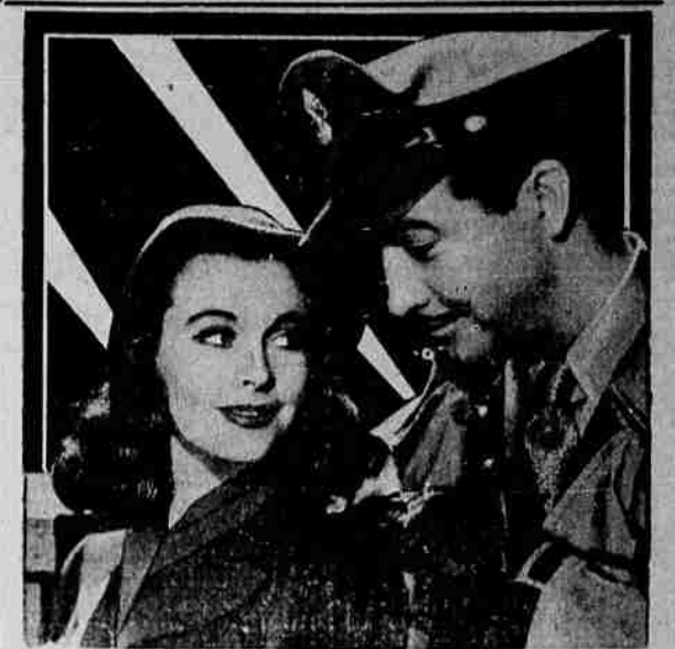
Vivien Leigh, widely acclaimed for her performance as Scarlett O'Hara in the recent production, "Gone With the Wind," and Robert Taylor, who will be seen at Hunt's Indian theatre Wednesday through Saturday in "Waterloo Bridge."