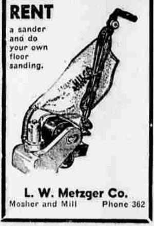
L. W. Metzger Co. Mosher and Mill Phone 362