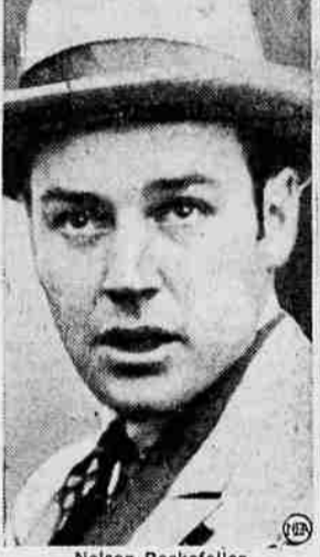
Nelson Rockefeller WASHINGTON, Aug. 17.—(AP)—President Roosevelt yesterday appointed Nelson A. Rockefeller of New York, son of John D. Rockefeller, Jr., to the newly created position of coordinator of commercial and cultural relations among the American republics.