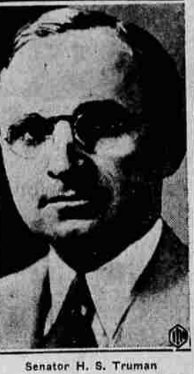
Senator H. S. Truman

ST. LOUIS, Aug. 7.—(AP)—Senator Harry S. Truman, who had been termed "the Pendergast senator" by his two opponents in Missouri's primary campaign, rode a swelling tide of city votes into the lead today in his bid for democratic renomination.