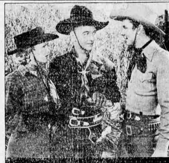
William "Hopalong Cassidy" Boyd, Russel Hayden and Ruth Rogers, coming to the Rose theatre Thursday in "Hidden Gold," for a three-day engagement.