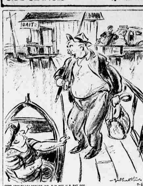
COPIED FROM THE NEWS-REVIEW, INC. T. M. REF. U.S. PAT. OFF.

"If an angry looking woman drives up and asks for me— you haven't seen me in a couple of years!"