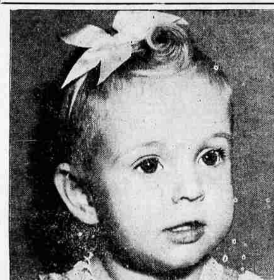
Baby Sandy, star of "Sandy is a Lady," coming to the Rose theatre Sunday for a three-day showing.