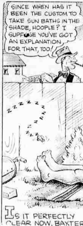
IS IT PERFECTLY CLEAR NOW, BAXTER?