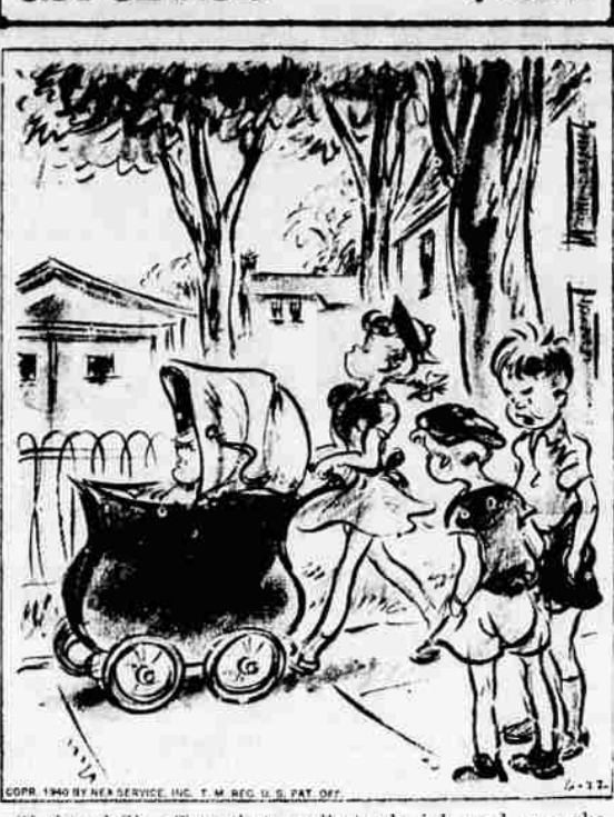
"I tipped Sis off that swell steady job, and now she won't even lend me a quarter!"