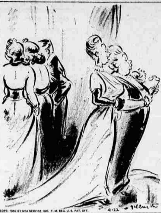
"I told Emily if she married a polo player she'd have to get used to a man smelling like a horse!"