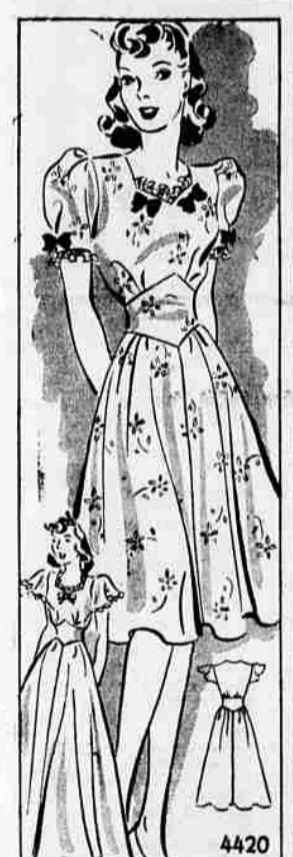
SWEET-AND-YOUNG PARTY DRESS PATTERN 4420