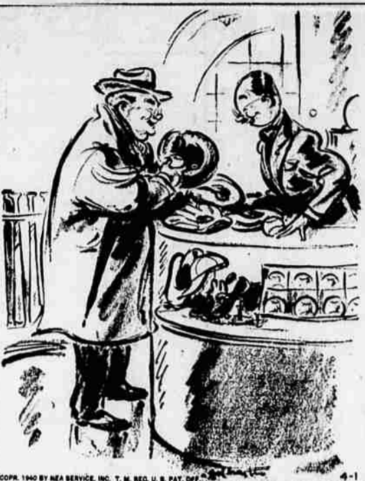
"I'm equipping my grandson, but darned if I don't think I'll take a glove for myself!"