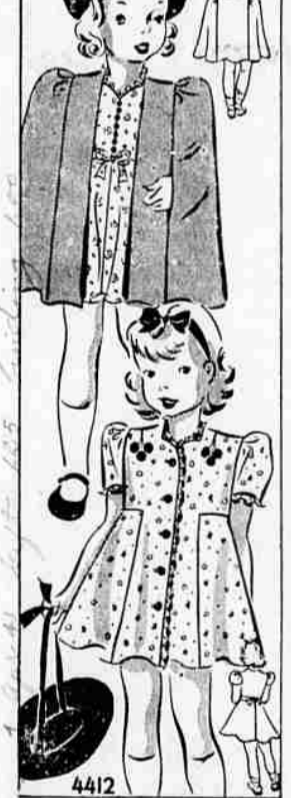
TGT'S DRESS AND CAPE ENSEMBLE PATTERN 4412