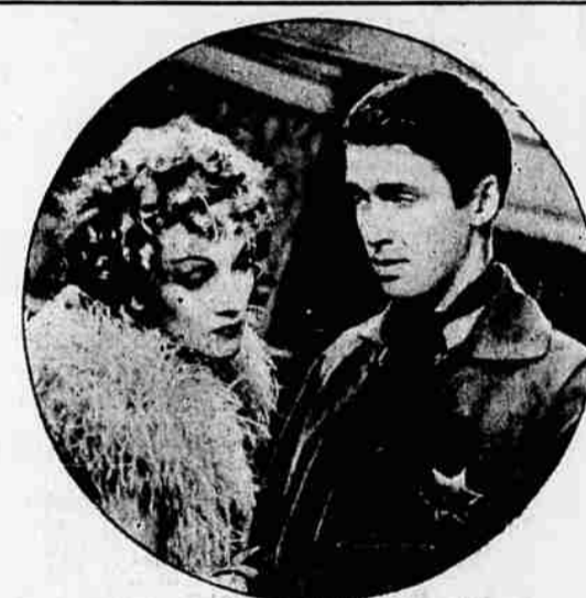
Marlene Dietrich and James Stewart, coming Wednesday in "Destry Rides Again," to Hunt's Indian theatre for a four-day engagement.