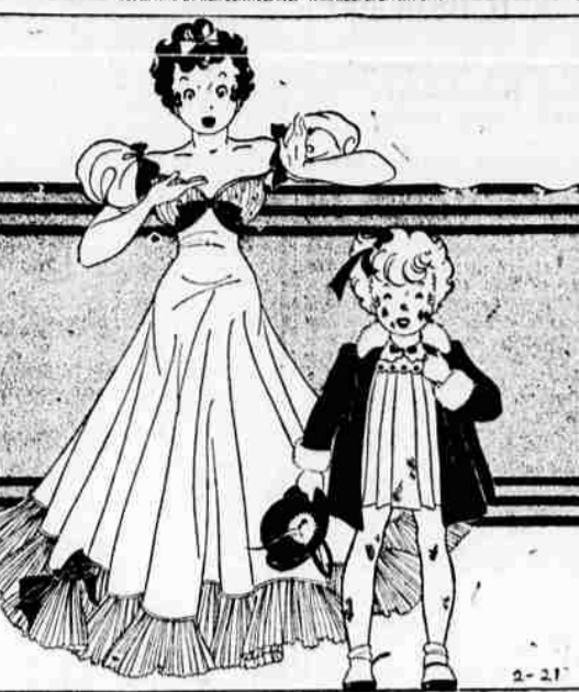
"Was it a nice party, baby?" "Ooh, swell! We didn't hafta play games or anything."