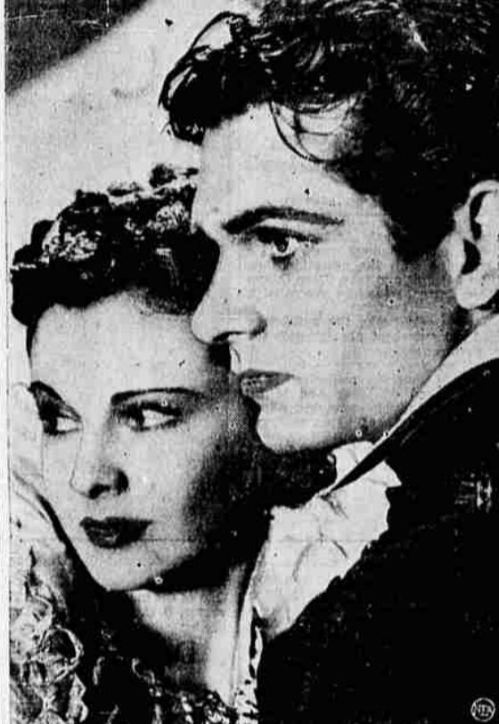
Vivien Leigh "Scarlett" O'Hara of the screen's "Gone With the Wind," sued for divorce in London. The suit names Laurence Olivier, seen above with Miss Leigh as they appeared in a recent picture.