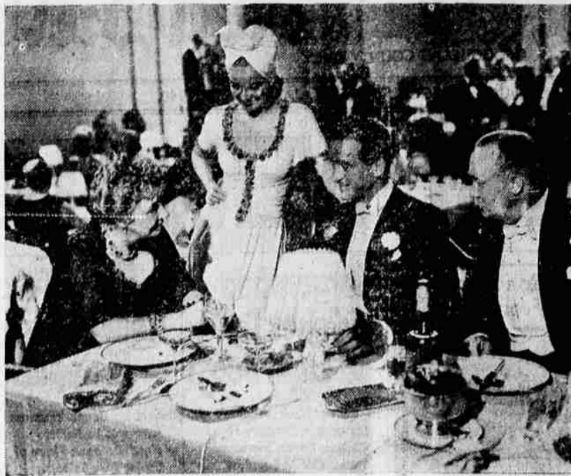
Scene from "Hallelu," co-starring David Niven and Olivia de Havilland, at the Indian theater in Roseburg for four days, starting tomorrow.