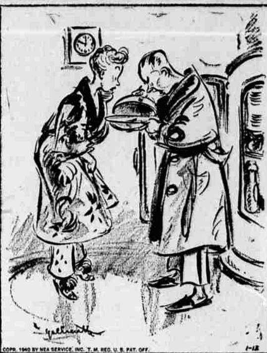
"I wish we could find a maid that doesn't have a yen for fried chicken!"