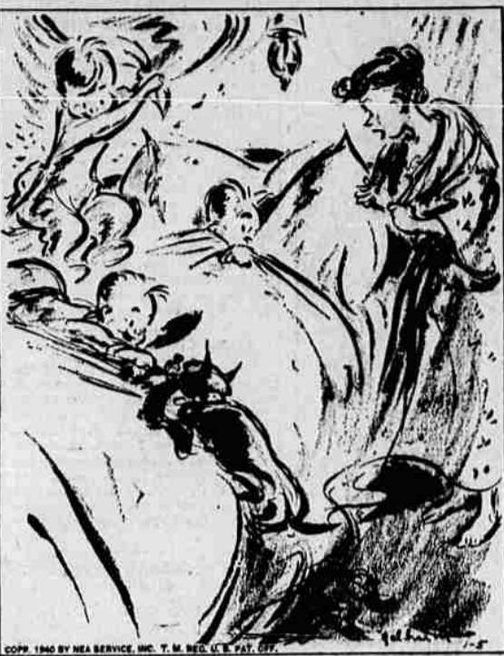
"That's right—get your usual Sunday morning rest while I get breakfast."