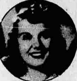
Coming Sunday to Hunt's Indian theatre in "First Love."