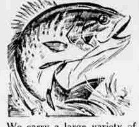
We carry a large variety of sea foods at all times.