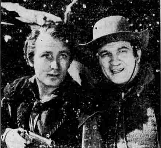
Brian Aherne (left) plays the title role in the picture, "Captain Fury," and Victor McLaglen plays the part of Blackie, which starts a three-day run at the Indian theatre Sunday. The story deals with the adventurous colonization of Australia and the part played by Fury and his gallant band on the frontier.