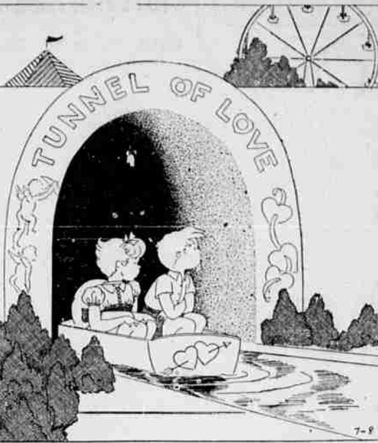
"You bet I'm mad! Pay a dime apiece an' it's so dark inside we didn't see a thing."