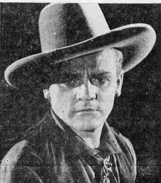
James Cagney has the toughest role of his two-gun career as "The Oklahoma Kid," a combination killer, bandit and hero, he gallops through history's pages in this dusty drama of America's stormiest days. "The Oklahoma Kid" opens today at the Indian Theatre for a four-day engagement. Also in the cast are Humphrey Bogart, Rosemary Lane and Donald Crisp.