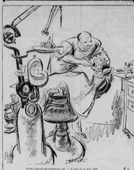
"Your wife tells me you're extremely fortunate and that your business is exceptionally good."