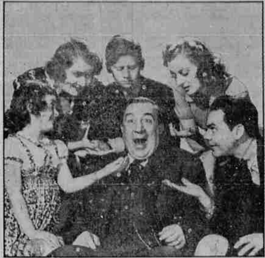
Hugh Herbert in a hilarious scene from the laugh-filled picture, "The Family Next Door." Also in the cast are Ruth Donnelly, Joy Hodges and Eddie Quillan. The second feature is "Undercover Agent," starring Russell Gleason and Shirley Deane.