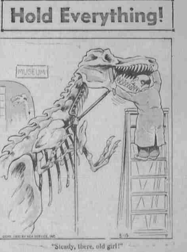
"Steady, there, old girl!"