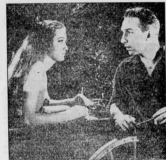
Dorothy Lamour and Floyd Nolan in a scene from "St. Louis Blues," which starts Thursday at the Indian theatre.