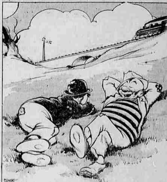
"Life has been good to me... once in Pittsburgh I was offered a job but outside of that I've met with nothing but kindness."