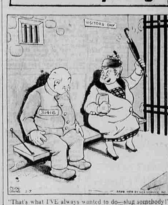
"That's what I've always wanted to do—slug somebody!"