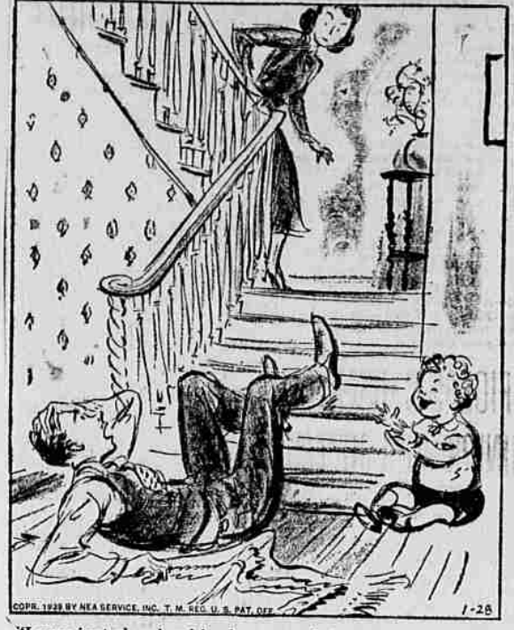
I was just showing him how easy it is to get hurt if he isn't careful on the stairs."