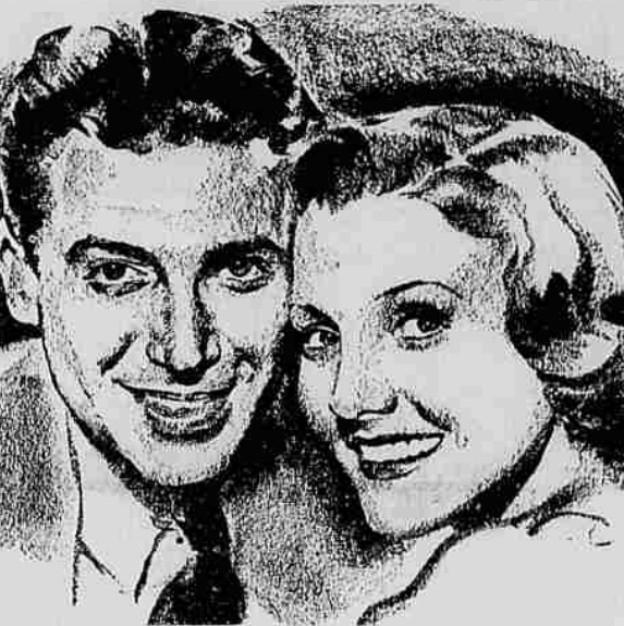
Jean Arthur and James Stewart, co-starred in "You Can't Take It With You," which opens Sunday at Hunt's Indian theatre. The cast includes Lionel Barrymore, Mischa Auer and a host of other well-known players.