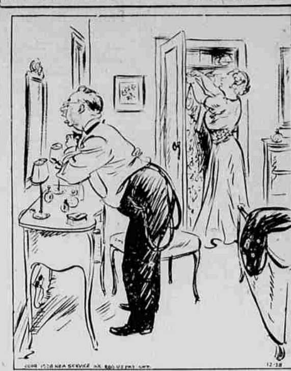
"I'll dress for dinner just once more. After that our daughter's friends will have to judge for themselves what kind of a family we are."