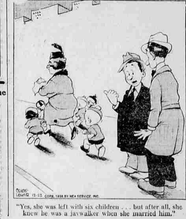
"Yes, she was left with six children... but after all, she knew he was a jawwalker when she married him."

When the youngsters "thumbed down" a motorist the two older ones climbed in.