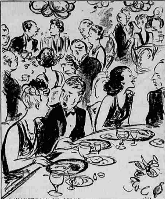
"Now listen, dear—if the boss should come over and speak to us this evening, please don't start talking about my salary."