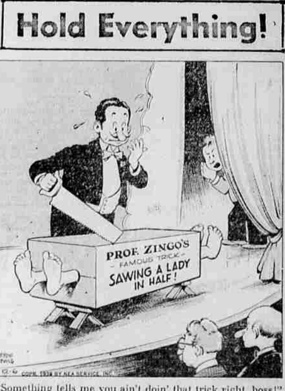
"Something tells me you ain't doin' that trick right, boss!"

FOR AN EVENING OF FUN Plan to Attend the Elks Night Club Dance at the newly decorated Elks Hall, Saturday, Dec. 10, 9 P. M.