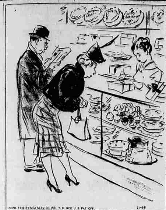
"I'd like to buy cakes and pies more often, but our cook eats them up so fast."