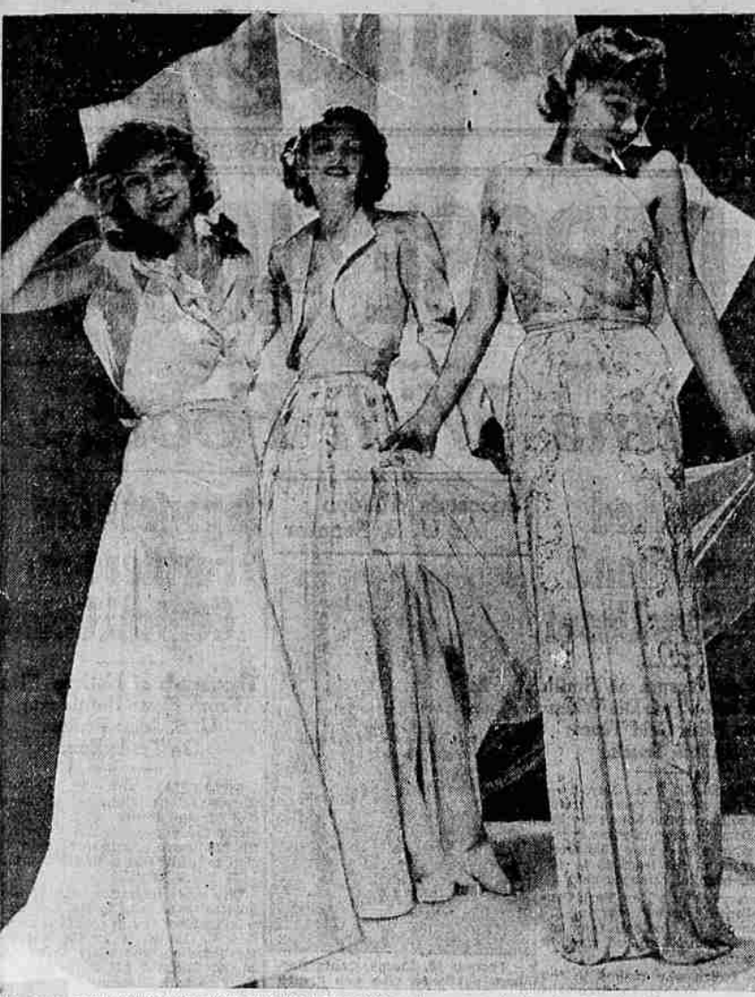
The three fashion graces above display charming new evening gowns by Paquin. On the left is a white satin creation with gathered fullness at the back falling into a wide train. The V-shaped bodice, underlined by double drills, is partly finished with midnight blue velvet bows on either shoulder. The model in the center is in rose pink satin, and is made of narrowing panels of the fabric that are stressed by little bows lined with blue to match the jaunty bolero. The model at right displays a streamlined gown embroidered in the new manner, in pale silk jersey and gold beads.