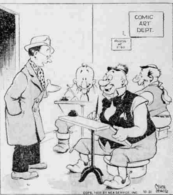
"Where do you fellows get all those ideas you put in the Junny papers?