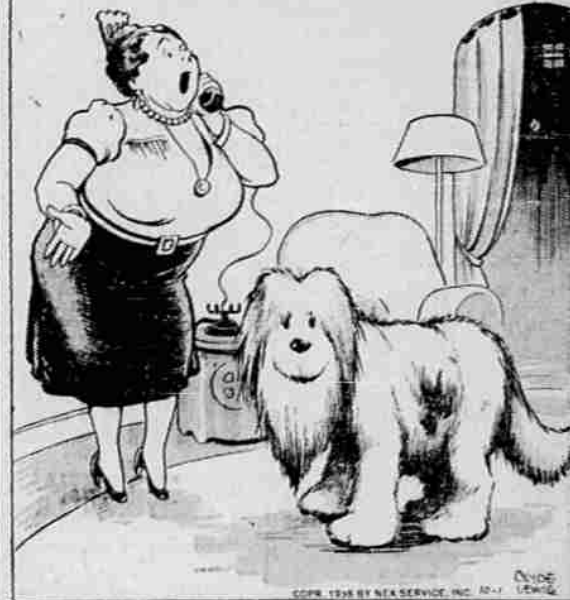
"Doctor, I'm just worried sick! He's getting to look more like Santa Claus every day!"