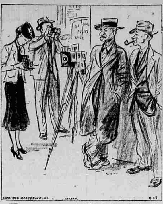
"These amateurs have shot this business to pieces."

ROSEBURG WOMAN'S CLUB TO HOLD FIRST FALL MEETING NEXT TUESDAY