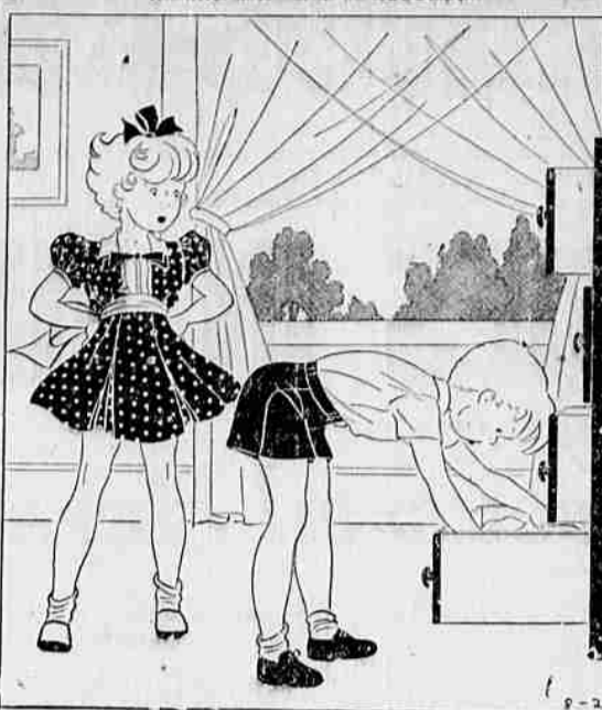
"You wouldn't hafta hunt your marbles if you'd put 'em away every time where they're s'posed to be, under the overshoes in the hall closet."